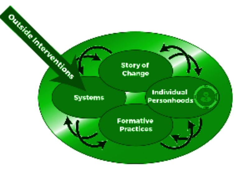
Figure 2.2 Injecting Interventions from the Outside

As pictured in Figure 2.2, the organization's projects often amount to injecting a new institution into the local community, which changes the systems in that culture. One of the key factors of the long-run sustainability of this new institution is the extent to which it fits with the story of change, systems, formative practices, and personhoods of the community. Just as the human body sometimes rejects an organ transplant if it doesn't match the rest of the body, communities sometimes reject interventions that don't fit with the rest of their cultures.